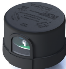
GW-LL127-1.5BK-40 Long-Life Control