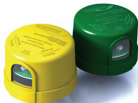
GW-LL347/480-1.5GN/YW-40 Dual Voltage Long-Life Microprocessor Control

Gateway International 360 is proud to introduce a NEW SUITE of newly designed and engineered controls which meets ANSI C136.10 standards, for an integrated suite of control product solutions at a cost tailored to meet your current field needs. Gateway International 360 has designed a more robust enhancement into our controls.