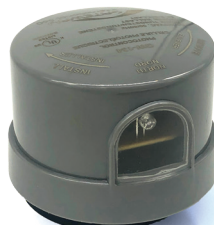
GW-134-1.5GY-20 Programable Control